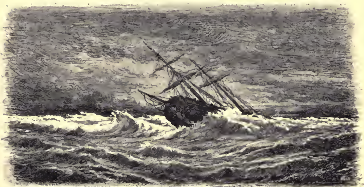
'Crossed in a storm.'

the goodness to write to him from time to time, to inform him of whatever he might wish to know, during his absence. He was much mortified to hear from the Doctor that he was obliged to remove, with his family, for some months, to a distant part of the north of England; and that, as to the Annals, they were immediately removing to the sea coast of Devonshire, for the benefit of a mild climate, and of sea-bathing. Ormond, therefore, had no resource but in his guardian. Sir Ulick's business, however, was to take him over to London, from whence Ormond could not expect much satisfactory intelligence with respect to Ireland.